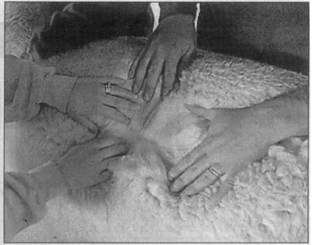
This alpaca is the huacaya type. He has a soft, crimped fiber that gives him a teddy bear look, in contrast to the straighter, finer "suri" type.

"In order to attend the class, they don't need to bring any of their own equipment with them, we supply equipment for them to learn how to shear," says Ward. "Anyone can attend, all they have to do is pay the fee and be willing to try it."