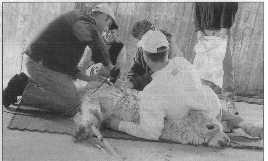
To begin the shearing, alpacas are restrained by tethering front and back feet and laying the animal on its side on a padded surface so they can't injure themselves or the shearer.

Another difference is "with shearing a sheep you have the whole weight of the animal between your legs, but it's a little easier shearing an alpaca because the ropes do some of the work by holding the animal down," said Good. "Also with sheep I'm bent over the whole time, but with the alpacas I'm on my knees a lot."